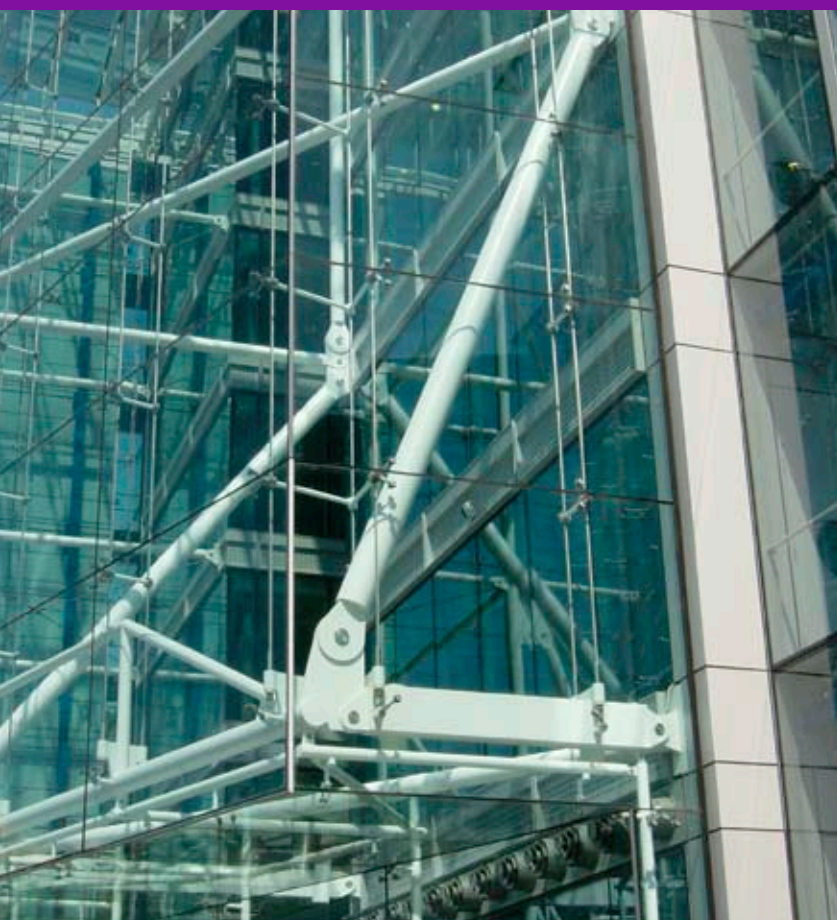
Richard Rogers Partnership, Europe-House