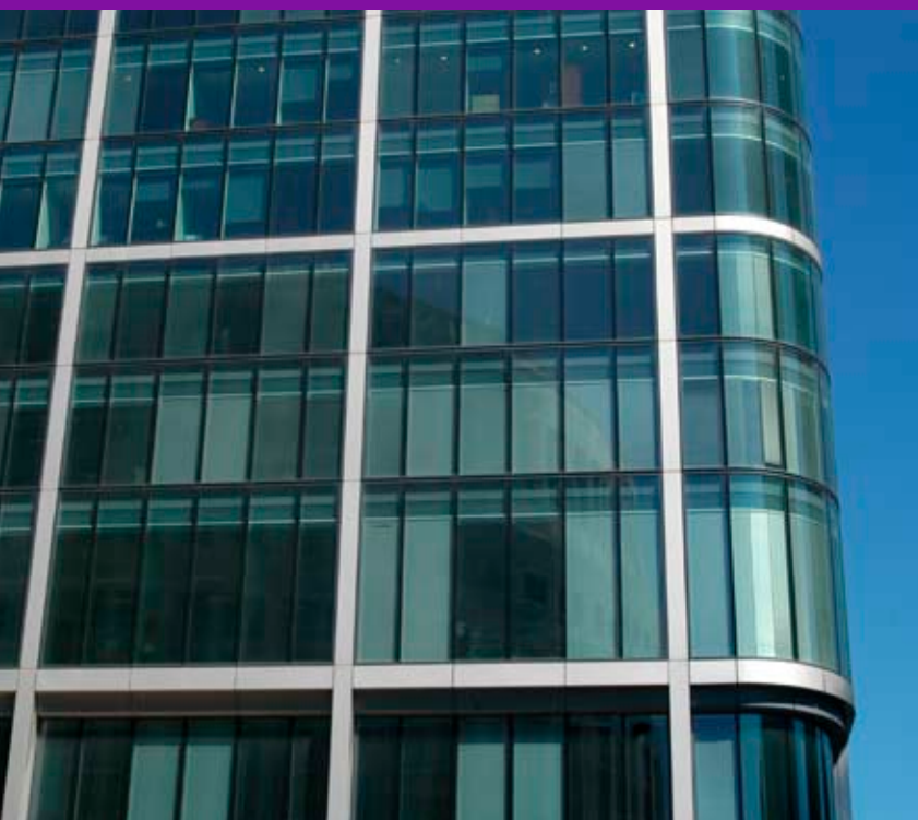
Foster + Partners, HSBC UK Headquarters