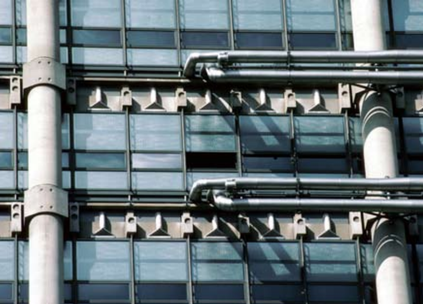
Richard Rogers Partnership, Lloyd's of London