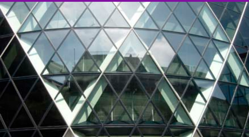
Foster + Partners, Swiss Re Headquarters