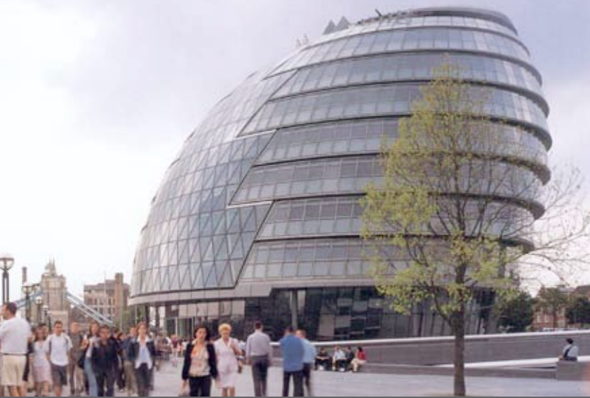
Foster + Partners, City Hall